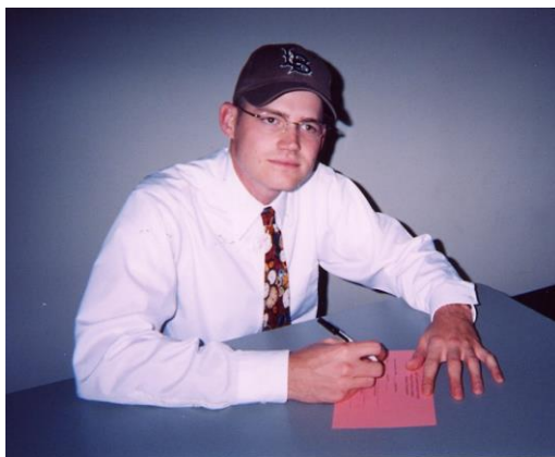
When you present your speeches, always be thinking of how your judge will react. Focus on making your speech interesting with your delivery and your content.

When you speak, you attempt to convince the judge in front of you, not yourself, not a different group of experts, and not a perfect judge who knows which speaker "truly" is the best. You have the right to expect that your judges will listen to your points, that they will not be biased in favor of one speaker, and that they will try to make the best decision that they can. However, that does not mean that your judge will make the decision you want, nor does it mean that your judge will be convinced by your speech, especially when your opponents are giving their own strong speeches.