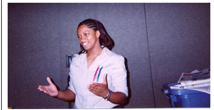
This speaker demonstrates her compassion for her topic.

Individual events are fun and educational. You get the opportunity to engage in an intellectually challenging discussion of ideas you and other smart people have. You develop skills that will make you a more effective advocate. And, perhaps most important, you develop a lasting group of friends who share your interests.